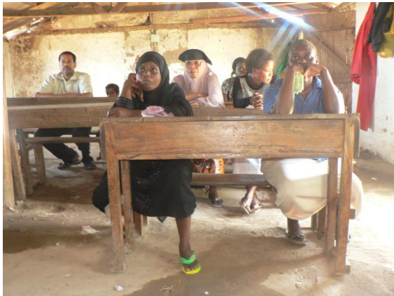
Parents keenly following the meeting proceedings.