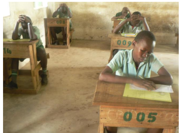
Class eight doing their last internal exams

This week the outgoing class sat for their last internal exam. They were determined and optimistic that they will make it come their final exam. We are praying for them and we too hope that they will excel.