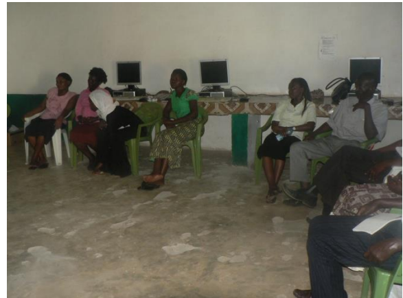
Teachers meeting in progress