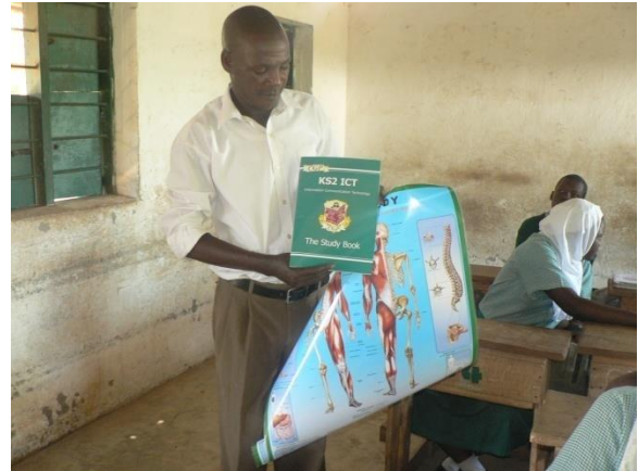
The head teacher displaying the map and I C T guide book

UK. We really appreciate his effort in making sure that everything is moving on smoothly. The I C T guide book and the map are helpful to us. We will appreciate if you will provide us with more of the primary level ICT text books. This is an area which is coming up in our syllabus and most of the schools introducing it lack text books.