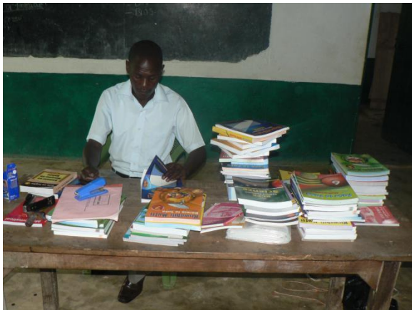
Rubberstamping the first batch of text books for school identity.